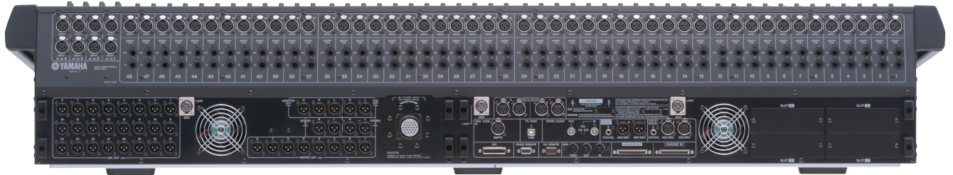
PM5D Rear Panel