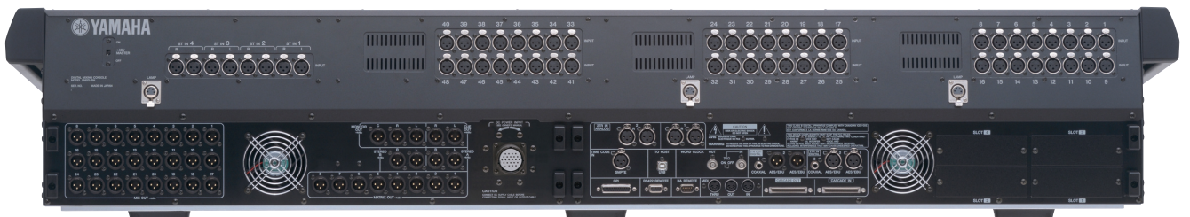
PM5D-RH Rear Panel