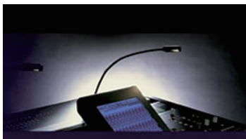
LA5000 Gooseneck Lamp